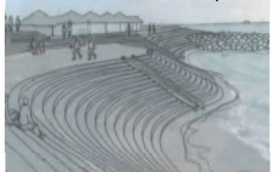
The Clarence Esplanade promenade as envisioned by ESCP